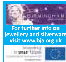
For further info on jewellery and silverware visit www.bja.org.uk